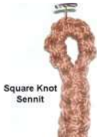
Square Knot Sennit

Tie Alternating Half Hitches with the two working cords onto the other two, which are holding cords.