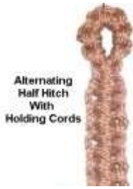
Alternating Half Hitch With Holding Cords